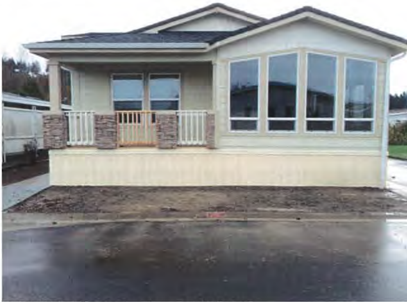
FRONT VIEW – Photo taken on 2/13/2015

If submitting more photographs than will fit on the preceding page, affix the additional photographs below. Identify all photographs with: date taken; "Front View" and "Rear View"; and, if required, "Right Side View" and "Left Side View." When applicable, photographs must show the foundation with representative examples of the flood openings or vents, as indicated in Section A8.