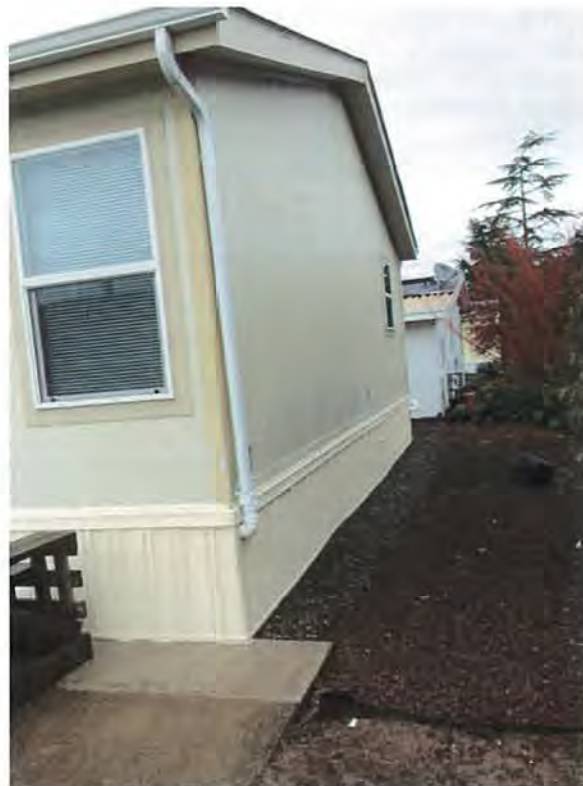
REAR VIEW – Photo taken on 2/13/2015